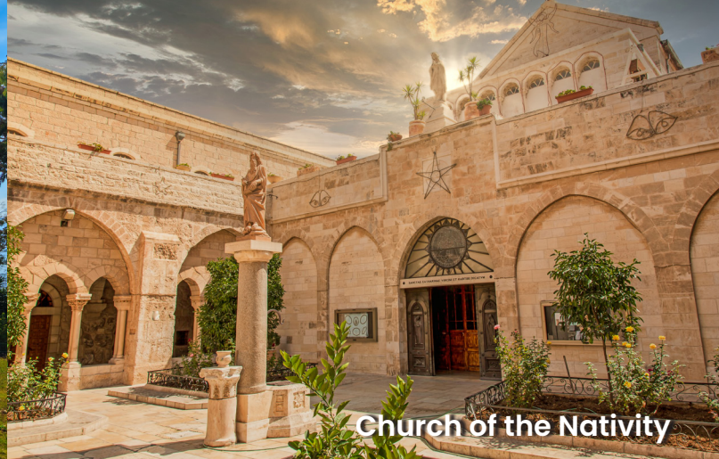
Church of the Nativity

of the Transfiguration. Dinner and overnight accommodations will be available at your hotel in Tiberias.