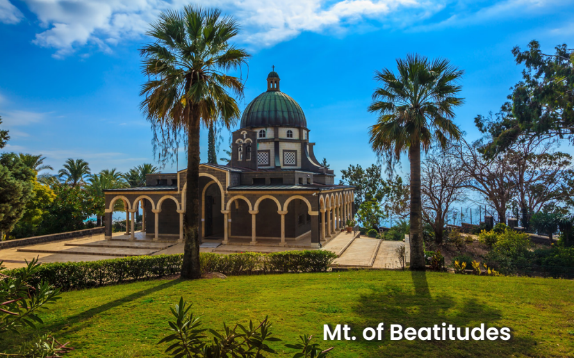
Mt. of Beatitudes